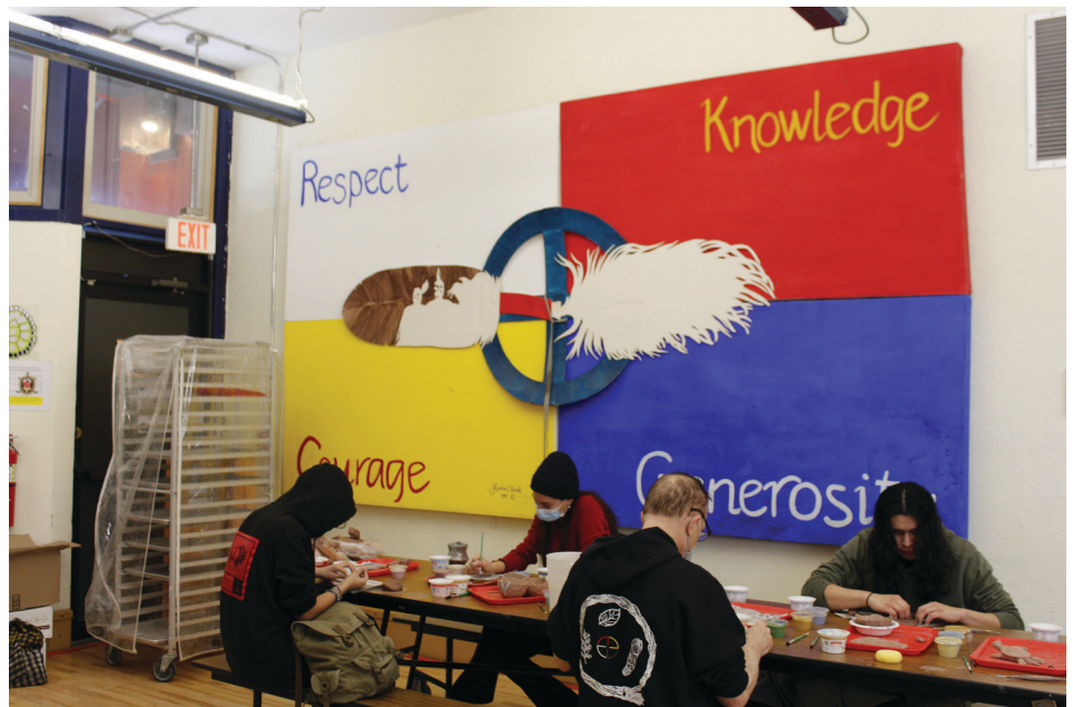
Nawayee Center School students working on their projects.

You might miss the school if you weren’t looking for it—it’s housed in a small, two-story brick building—and includes a garden and fenced-in outdoor area. The school currently serves 40 students, approximately 95% of them identifying