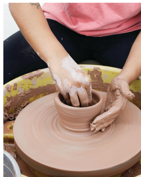
A student throws a bowl on the wheel.

Honor the moms in your life by creating something beautiful together or to give as a gift. In this floral-inspired class, you'll handbuild a vase and personalize it with texture, pattern, and color.