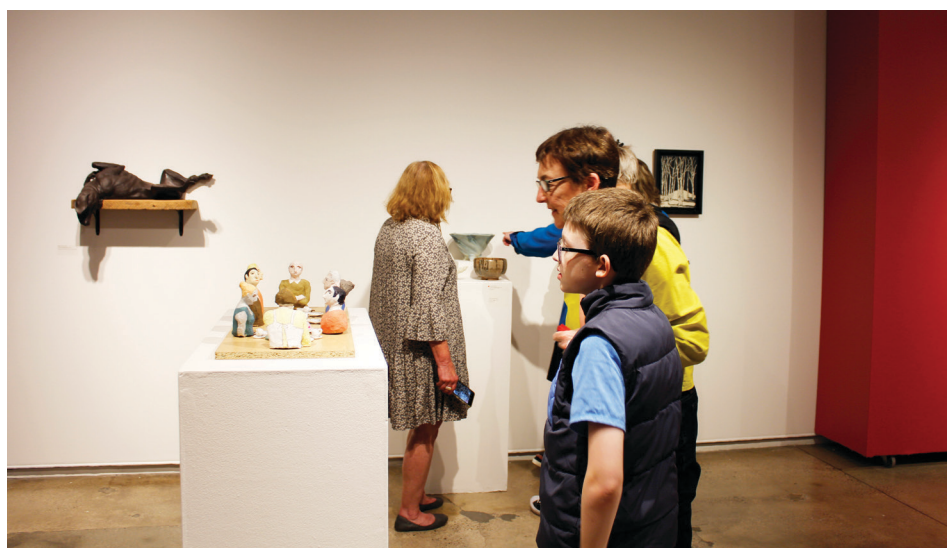
Attendees admire the artwork during the Members Exhibition and the K-12 Educators and Students Exhibition .

Applicants need NOT be members to apply to this exhibition.