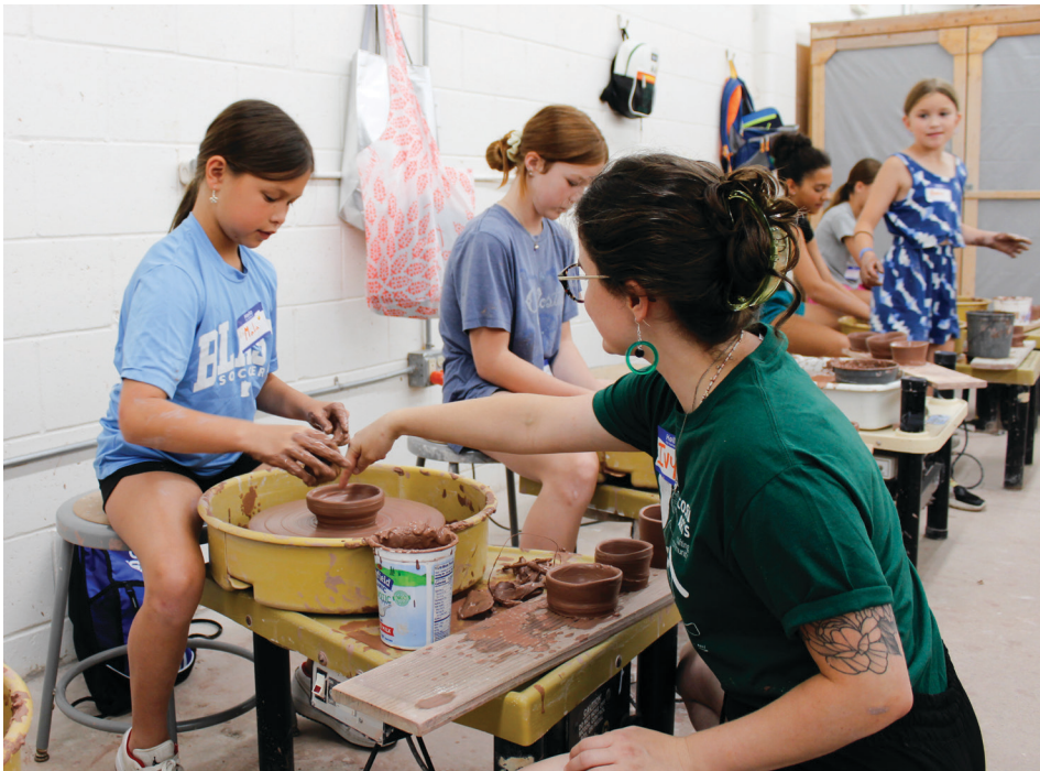
NCC clay camp teacher helping students throw on the wheel.

Northern Clay Center seeks individuals ages 18+ for our 2026 summer camp positions. Every year, NCC recruits paid Clay Camp instructors and Clay Camp assistants. We offer over 40 four- and five-day camps which explore the basics of handbuilding (ages 6+) or wheel throwing (ages 9+), and occasionally some special collaborations with nearby art organizations.