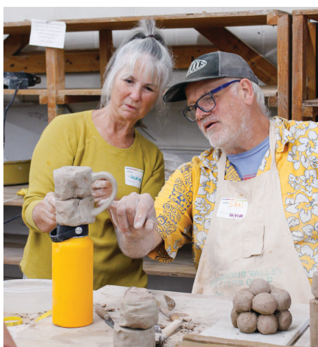
A student learning about handles.