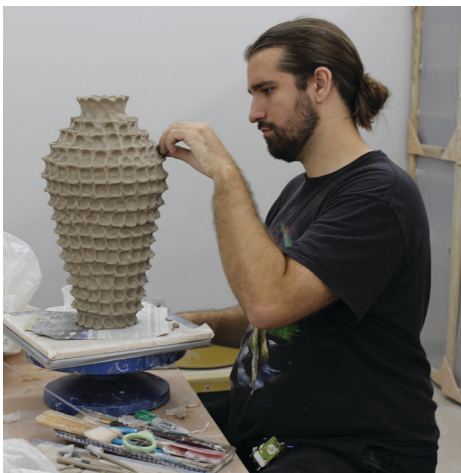
A student works in the handbuilding studio.

work towards bringing their creations to life, balancing between their vision and structural security. Slab and coil techniques will be used to make medium to large scale (6" to 12") interpretations of their work.