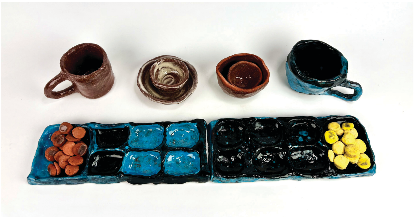
Finished mancala set, mugs, and bowls.