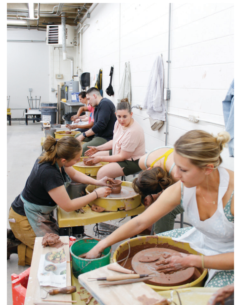
Students learn to throw on the wheel.

In this class, students will explore all manners of texture, glazing, and a combination of the two. Using tools, things found around the home, or even objects found outside in nature, we will find new and interesting ways to finish the surface of a pot. During the class, we will also talk about how glaze will interact with these surfaces, and glazing techniques to strengthen the textures we created on the surfaces of our pieces.